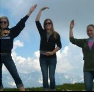
KSU in the Alps 2012