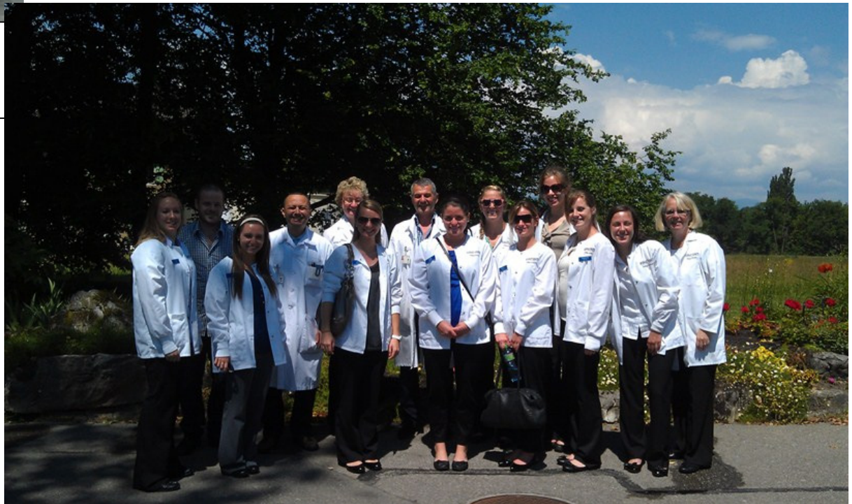
Nursing students and faculty following their shadowing experience at University Hospitals of Geneva, Switzerland