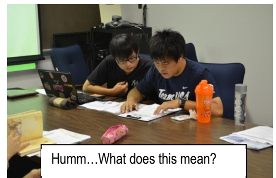
Humm...What does this mean?