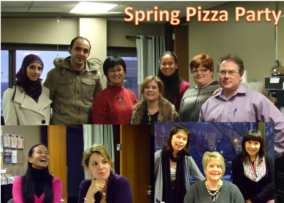
Students and faculty—Having a wonderful time with the conversations, food, and prizes...