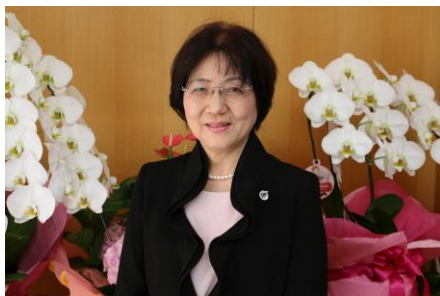
President, Saku University

We are waiting to welcome applicants with pioneering spirits.